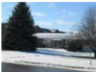
View of new Association office from the corner of First Street & Barnswallow

Since the decision was made by the Board to undertake the building of an apartment complex that would support people with complex care needs and support changes due to aging we have been very busy. In December the Board chose the site for the future complex and we placed an offer to purchase on the property next to Leisure World. We have engaged the service of Brian L. Shantz Ltd. And Architecture Incorporated to assist us with our zoning change application, in resolving issues related to the development of the property and to assist in the design of the building and new office space.