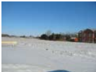
Rear perimeter of property next to Leisure World