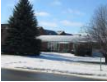
New site for Association Office