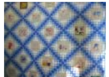
30th Anniversary Picture Quilt

member and her friends and family. We want to thank them for taking the time to piece and quilt this very unique and special item. This is definitely a one of a kind piece so make sure that you come out and see it. If you have any items that you would like to donate please call the office to arrange for pick up. The support of this community is a very large reason our Auction has made it 30 years. We are looking forward to seeing you on October 25th!