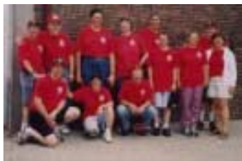
Woolwich Special Olympics

The Woolwich Special Olympics played in their first ever slo-pitch tournament in Brantford on July 26th.