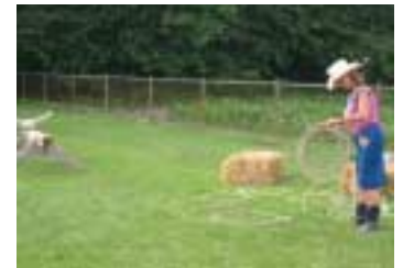
Cow roping at the Carnival