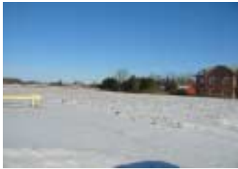
Proposed Building Site For Retirement Complex

The Board has been very busy this past year and the acquisition of a property to be the site of the new Association offices and proposed Apartment Complex have occupied a great deal of their time. In August the Association acquired the property next to the Leisureworld Complex and this will be the location of the new Association Offices and the proposed Retirement Complex for 16 adults whose accommodation support requirements are changing as they get older.