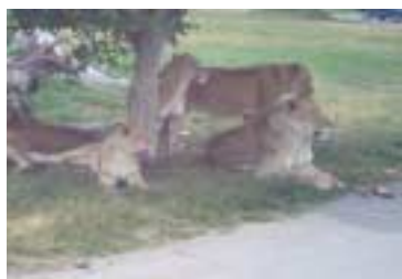
The Summer Program at African Lions Safari