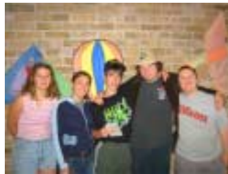
Summer Fun Gang