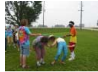
Tropical Theme Party