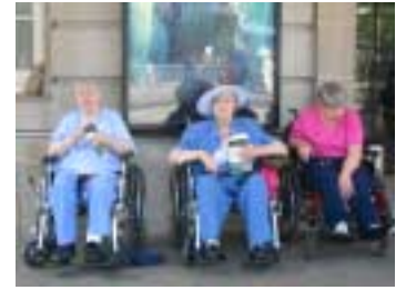
"Where's the Bus?"