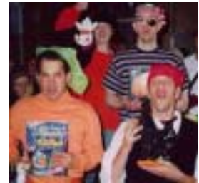
Pirates on the Dinner Cruise

March & April bring spring and we hope to look at planning one of our famous trips to a show in Toronto. Yes we are planning that far ahead. Just because winter is upon us does not mean the Recreation Committee wants to hibernate. We stay active all year through and anxiously await providing fabulous events and recreational outings throughout 2003.